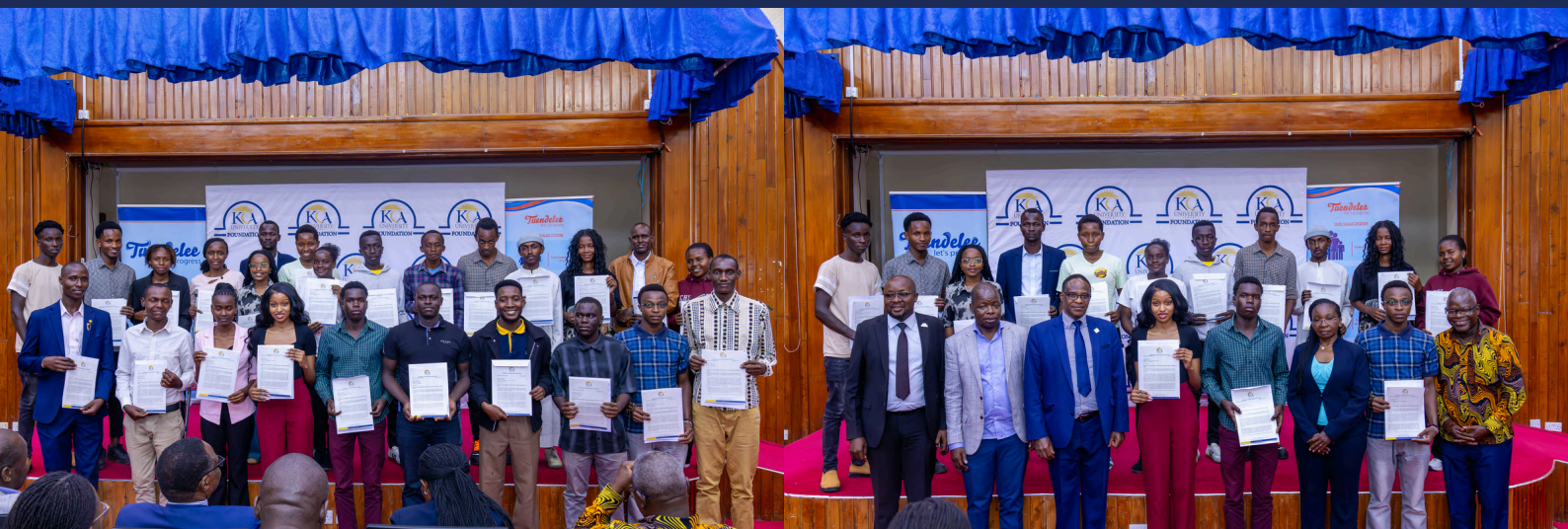
2025/2026 Scholarships 26 Awardees