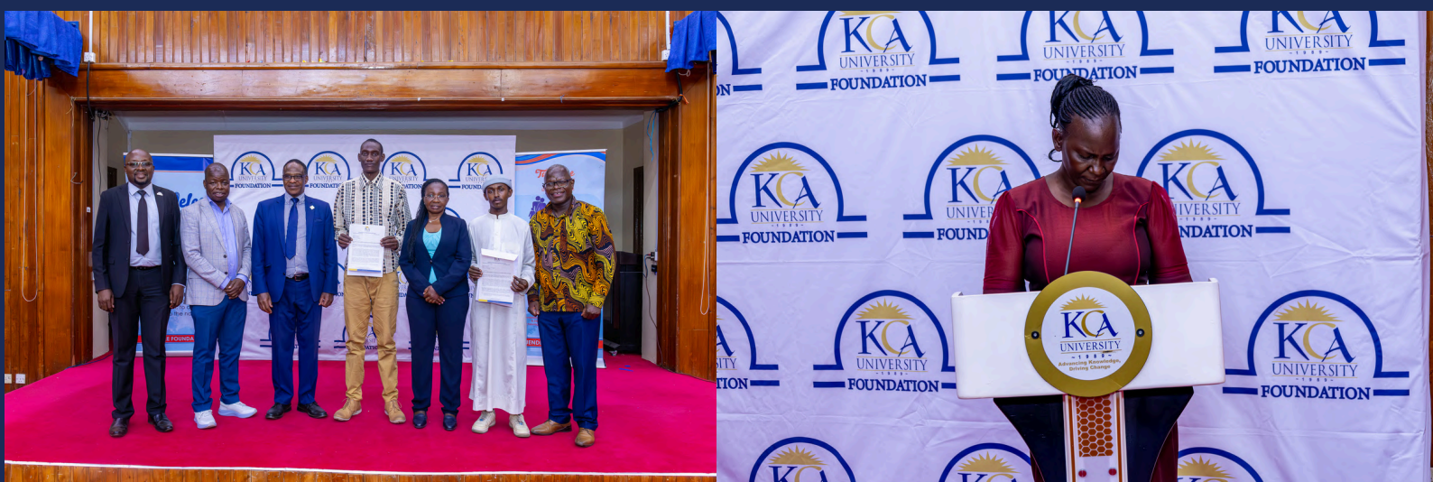
2025/2026 Talent Scholarships Category 2- Awardees