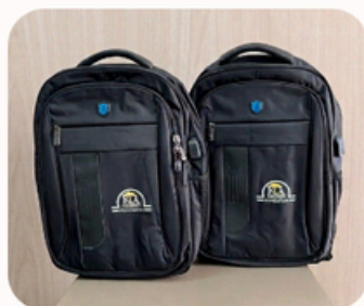
Rucksack Bag (Available in Black) Ksh 3,200