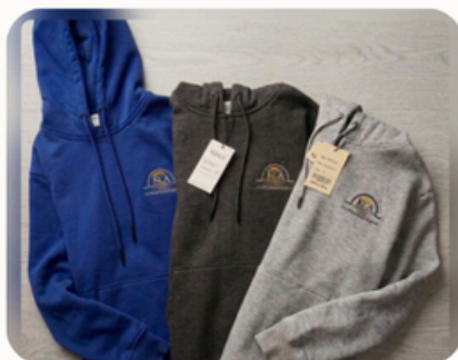
Non-Zipped Hoodie (Available in light & Dark Grey, Black ,Yellow, Blue, Purple) Ksh 2,800