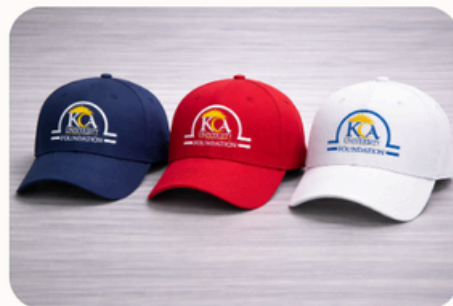
Caps (Available in Black, white, red, grey) Ksh 900