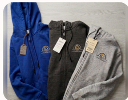
Zipped Hoodie (Available in light & Dark Grey, Black ,Yellow, Blue, Purple) Ksh 2,800