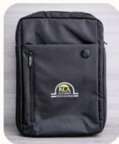
Sling Bag (Available in Black ) Ksh 2,500