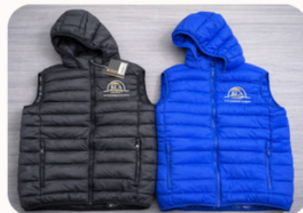
Puff Jacket (Grey Blue ,White Black ) Ksh 3,100