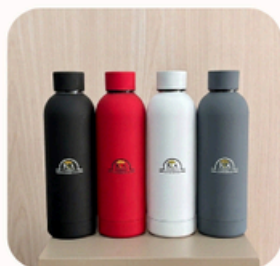
Thermoflask (Available in Black, Green, Red and Green) Ksh 1,600