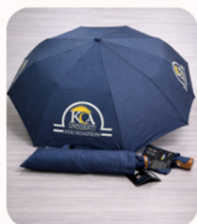
Umbrella (Available in Black and White) Ksh 1,800